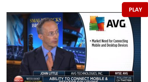
Company: AVG (NYSE: AVG) Product Type: CEO Interview