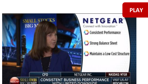
Company: Netgear(NASDAQ: NTGR) Product Type: CEO Interview