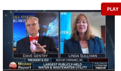
Company: American Water (NYSE: AWK) Product Type: CEO Interview